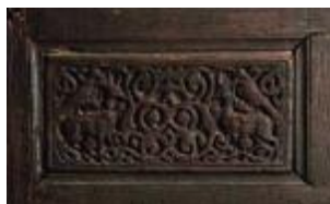
Screen of the sanctuary of St. Barbara http://imagecache2.allposters.com